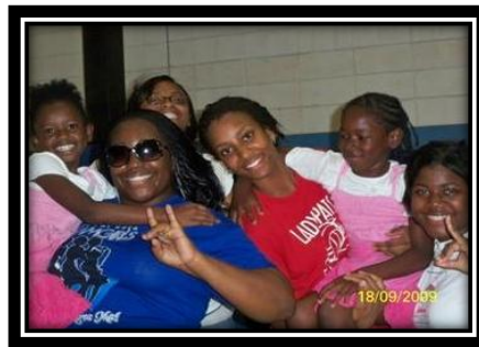
SMART Girls (Boys and Girls Club)

members have participated in Volunteer Valdosta, Adopt-A-Highway, Bagging Groceries at Harvey's, and Lowndes County Feed the Hungry Day events. The chapter also participated with VSU Softball team to host a Red Cross Blood Drive where over 200 units were