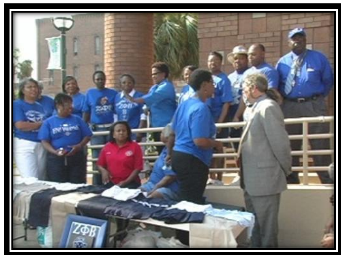
Albany Chapters of Zeta Phi Beta and Phi Beta Sigma donated nearly 300 school uniforms to a pair of schools.