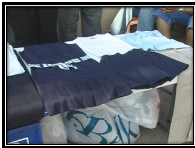
Turner and Alice Coachmen Elementary will be the recipients of the donations.