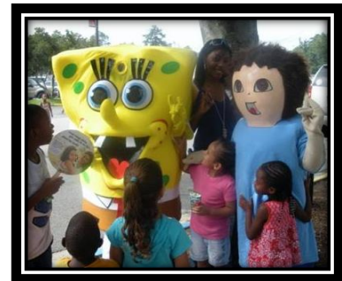
Lowndes County Feed the Hungry Day Event