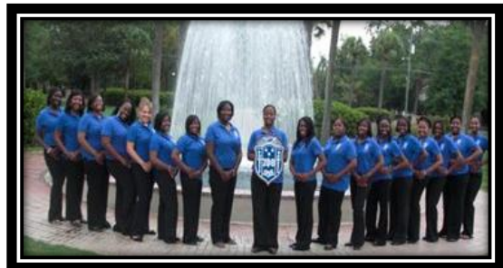
Zeta Phi Beta Sorority, Inc. Alpha Theta Chapter

An upcoming Alpha Theta Chapter event is Lowndes County Baby Love 1 st Birthday Party November 7.