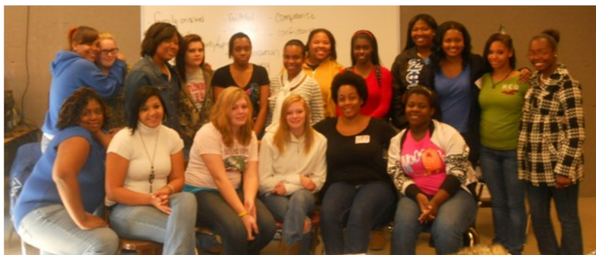
Omicron Nu and their “Ladies of the Dove” mentees

“GEORGIA STATE LEADERSHIP CONFERENCE MARCH 23-25, 2011 IN MACON, GA.